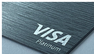
Payment Scheme logo knocked out to foil