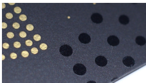
Glossy tactile varnish on dots

Thales can support you throughout your Metal Card Design journey