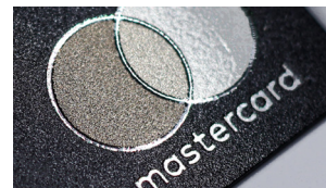
Payment Scheme logo in Premium Printing