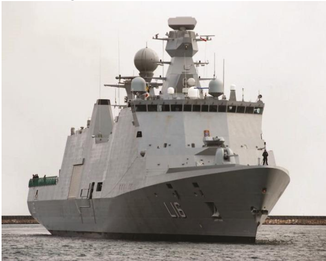
HMS Absalon with the Thales SMART-S Mk2 surveillance radar

As Thales recognises the high quality of Danish research, it is a principal objective to recruit local employees and establish long-term cooperation with Danish universities and regional research centres. The markets we aim to address lie within aviation safety and defence & security technology.