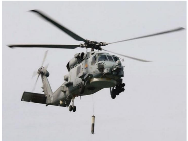
A US Navy MH-60R Seahawk with a Thales dipping sonar

In 2019 the Danish MoD decided to upgrade their Seahawk MH-60R helicopter with dipping sonars for anti-submarine warfare through foreign military sales with the US government. The dipping sonar is manufactured by Thales under the name FLASH and Denmark will update seven helicopters expected to be delivered in 2024.