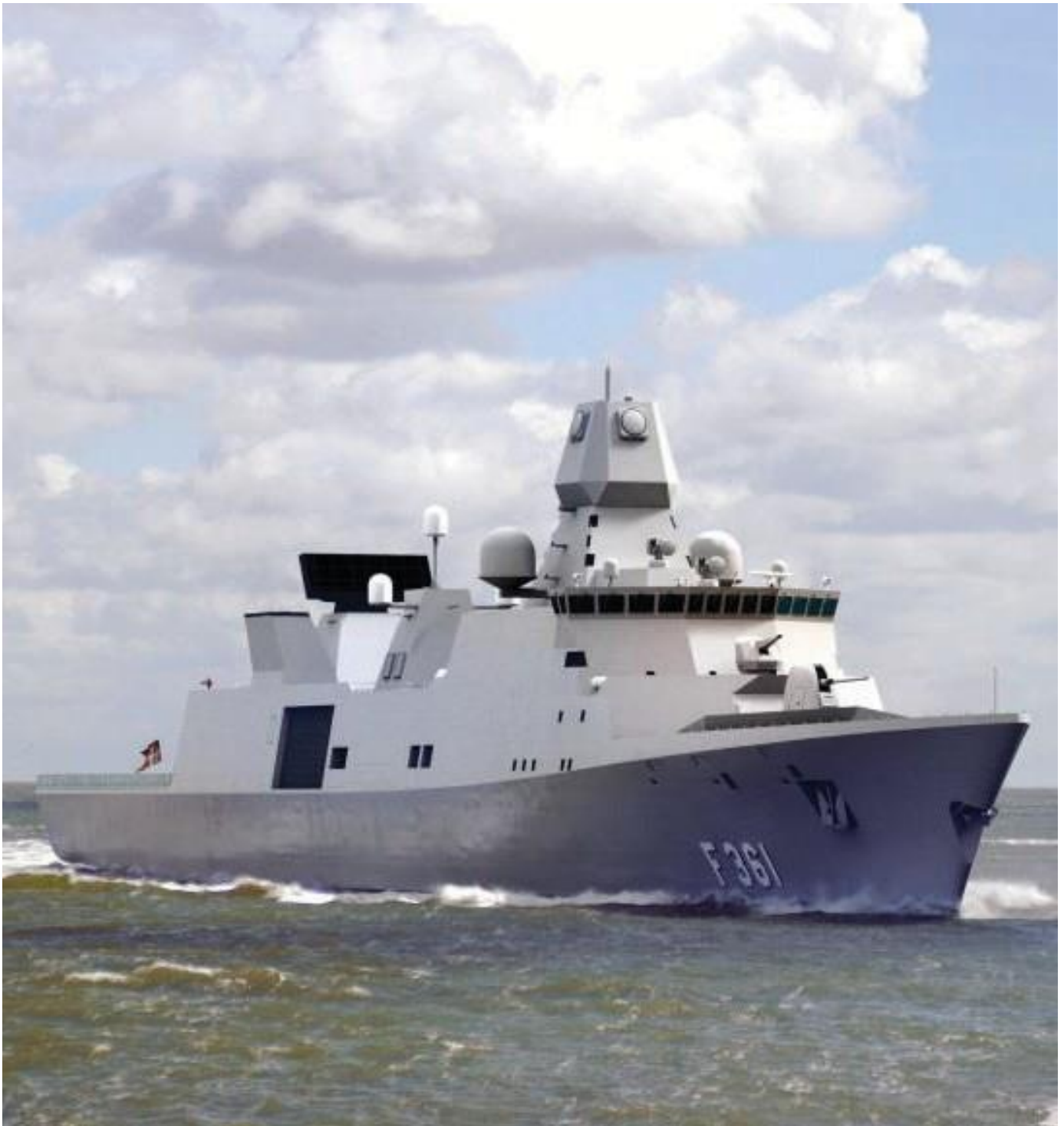
HMS Iver Huitfeldt with Thales APAR multifunction radar and Thales SMART-L volume search radar

Today, Thales Denmark ApS employs 45 people at the Headquarter in Ballerup.