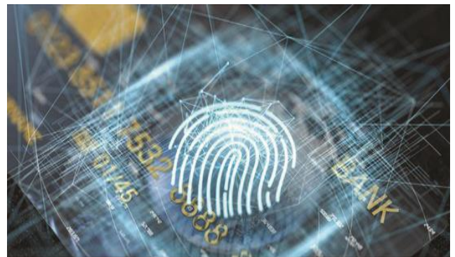
A fingerprint credit card validates a POS payment