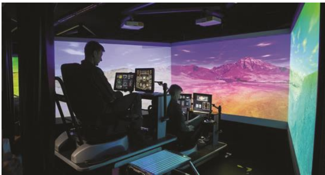
Helicopter simulator

Funded by NATO (NATO/SHAPE/MHI), the technical training simulator consists of two interconnected and reconfigurable helicopter cabins in Mil Mi-17 and Mil Mi-35 versions.