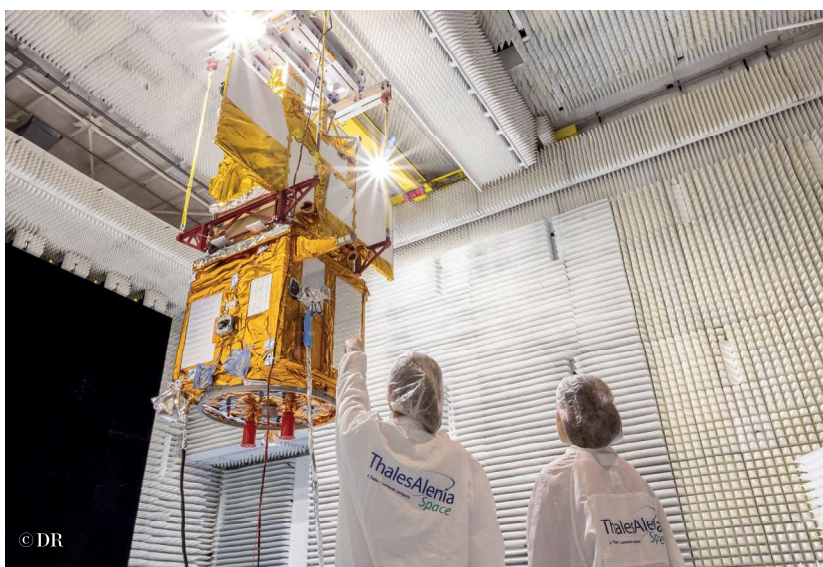
The SWOT satellite collects data on surface water levels, river and lake flow characteristics, and ocean topography.

Looking ahead, satellites will be only part of the picture, and the Thales-led joint venture is actively investigating other space-based solutions under a number of EU feasibility studies. The Advanced Space Cloud for European Net zero emission and Data sovereignty (ASCEND) project, for instance, is exploring the possibility of reducing the environmental impact of data centres by putting them in space. The SOLARIS programme, meanwhile, is investigating whether orbiting solar farms could beam clean energy back down to Earth. Reality is catching up to science fiction!