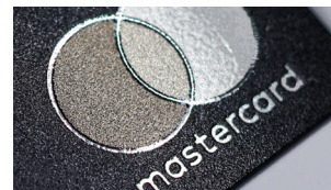
Payment Scheme logo in Premium Printing