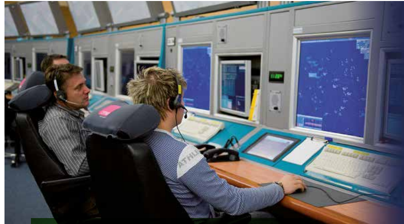
THALES'S AUTOMATION SOLUTIONS SUPPORT TODAY AND TOMORROW'S AVIATION SYSTEM